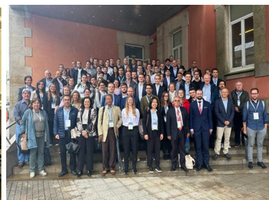
PPS attendees take a picture at the closing ceremony for PPS-2024 in Ferrol.