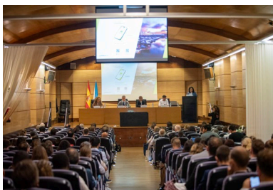
Delegates attend the opening ceremony of PPS-2024 Regional Conference at Ferrol.