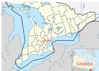
Guelph, near Toronto in Ontario, Canada, the place for PPS-2025 Americas Regional Conference.

For many years, Guelph had one of the country's lowest unemployment rates throughout the Great Recession. In late 2018, the Guelph Eramosa and Puslinch entity had an unemployment rate of 2.3%, which decreased to 1.9% by January 2019, the lowest of all Canadian cities. (The national rate at the time was 5.8%.) Much of this was attributed to its numerous manufacturing facilities.