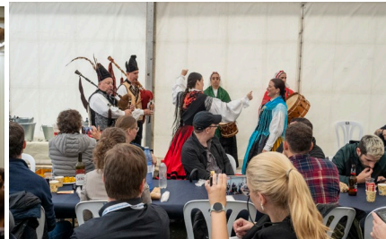
First luncheon of PPS-2024 under the local music and dance group of Santaia.