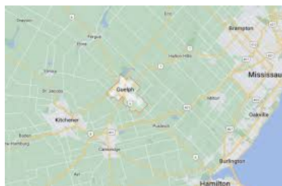
Guelph is a medium city in the Province of Ontario, near Lake Ontario in Canada.