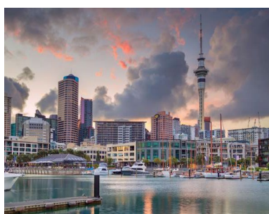
Auckland is a large metropolitan city in the North Island of New Zealand.