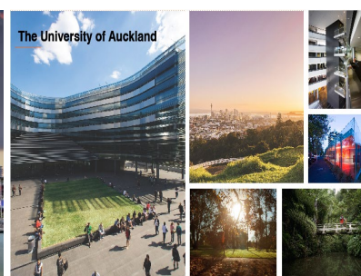
A view of the University of Auckland in New Zealand.