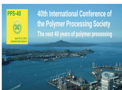
Auckland, New Zealand, the place for PPS-40 International Conference.

There is a visa requirement for some countries. Please check.