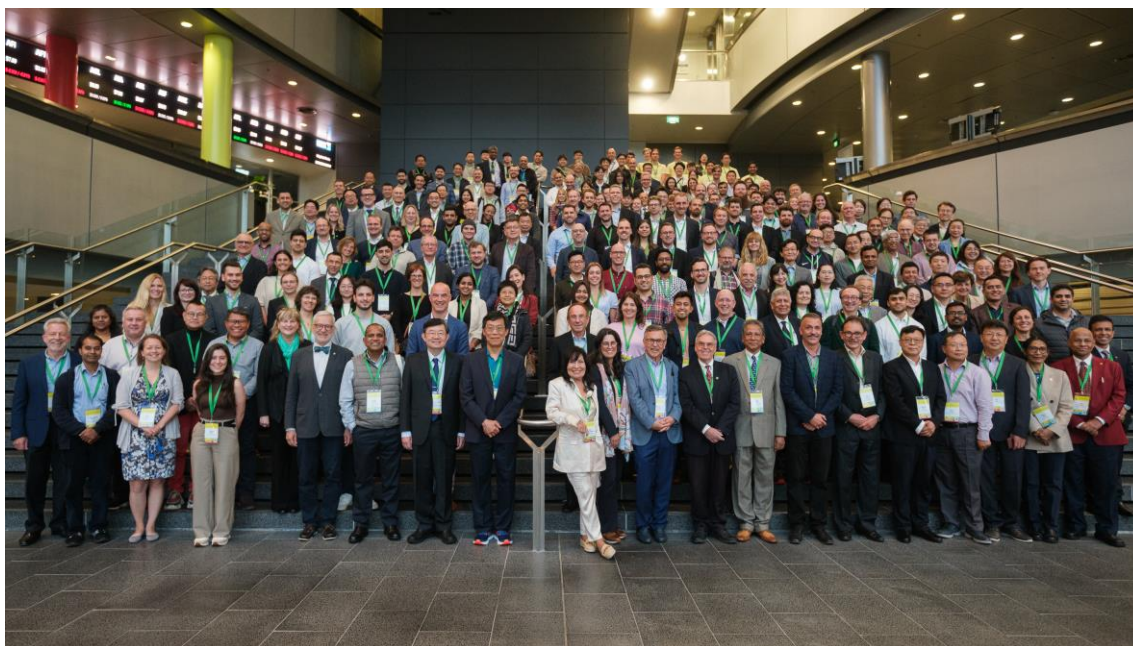
PPS attendees take a picture at the ceremony for PPS-40 in Auckland.