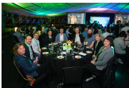
PPS attendees around the table at the banquet of the PPS-40.