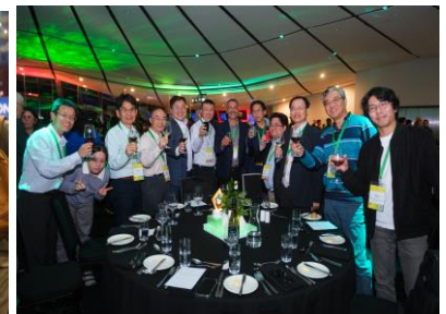
PPS attendees take a picture at the banquet for PPS-40 in Auckland.