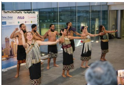
Ritual dance from Maori people at the lobby of the Conference venue.