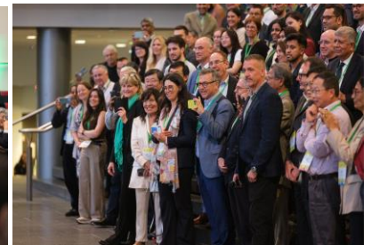
A photo of the delegates of PPS-40 at the lobby of the Conference venue.