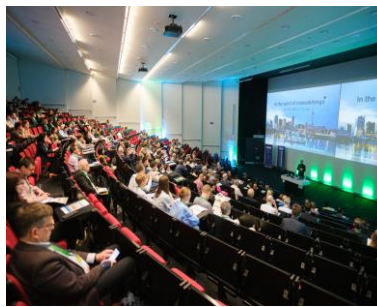
Opening ceremony at the Auditorium (main venue – OGGB).