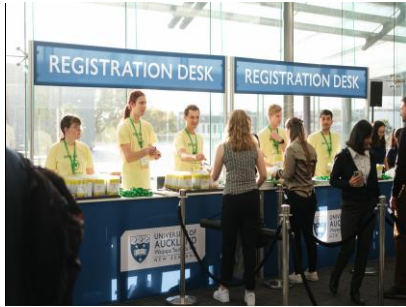
A view of the Registration Desk at the University of Auckland.

"Tāmaki desired by many", in reference to the desirability of its natural resources and geography.