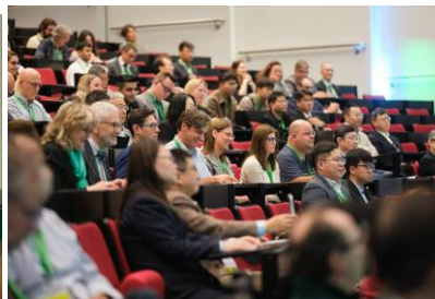
Delegates attend the opening ceremony of PPS-40 Conference.