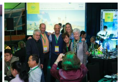
PPS attendees take a picture at the banquet for PPS-40 in Auckland.