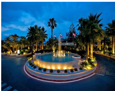
The hotel and conference center features a unique meeting and banquet space.