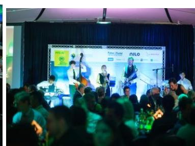
One big band at the banquet swinging music themes.