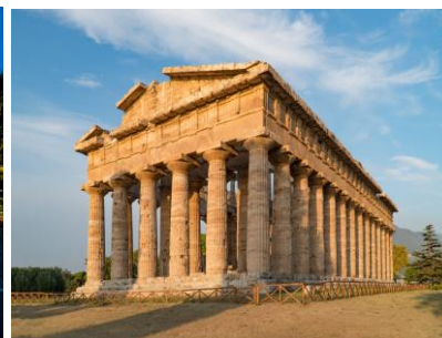
Ancient Greek Temple of Hera, Paestum, built in the Doric order around 460-450 BC.